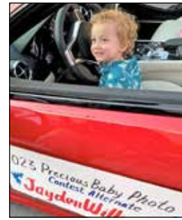
Participants waiting to feed in to parade