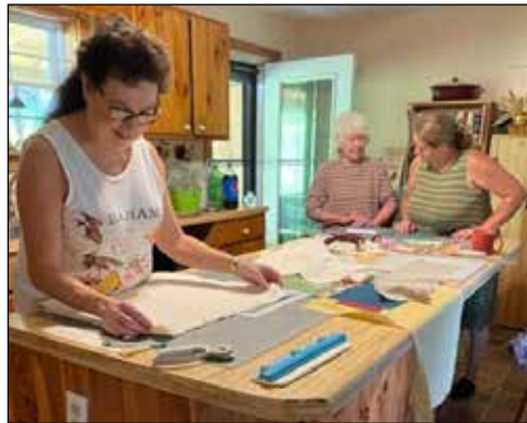
Making quilts for the auction at the Gospel Sing