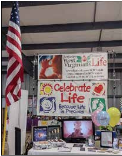
The Berkeley County Chapter shared the Miracle of Life to visitors at the Berkeley County Youth Fair.