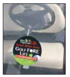
The infamous so-called-removable cart sticker