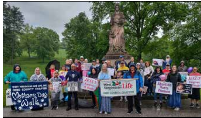
Mother's Day Walk for Life