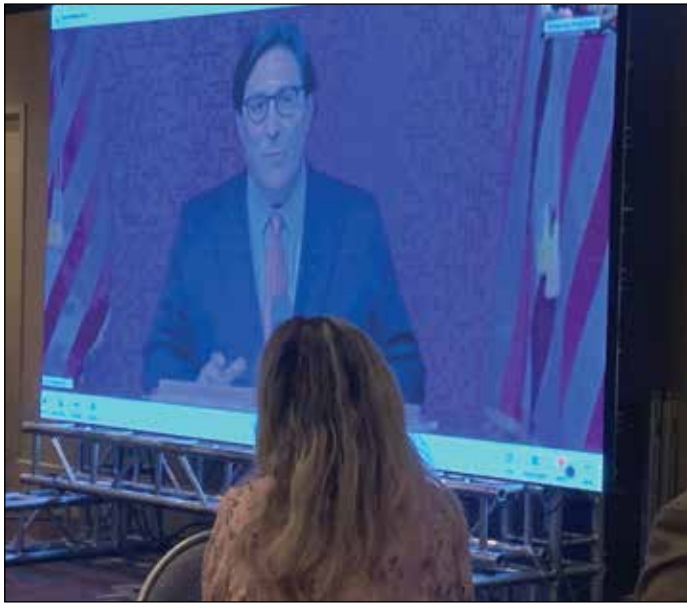
Keynote Speaker Jay Sekulow was live, but remote.