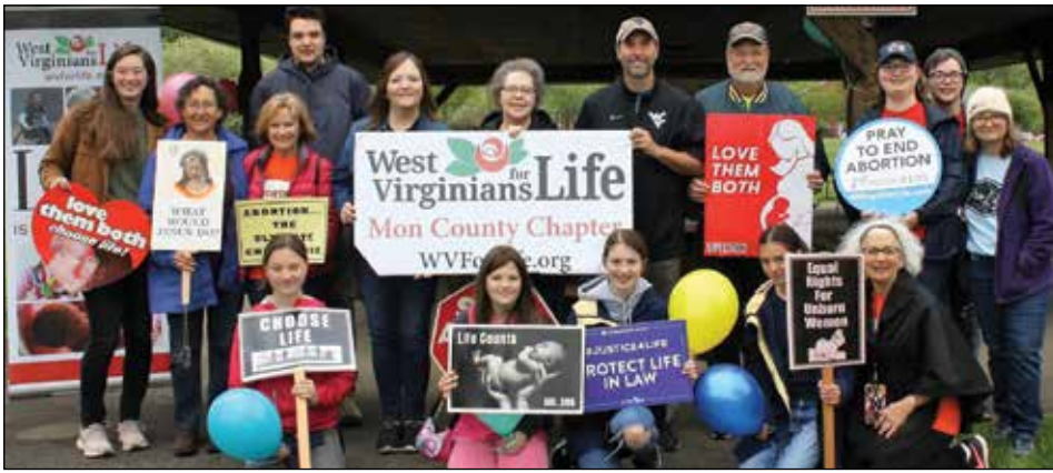
Whole Group Prior to Walk