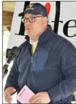
Senator Mike Oliverio