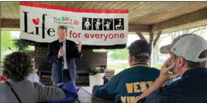
Secretary of State Mac Warner addressed the Walk crowd.