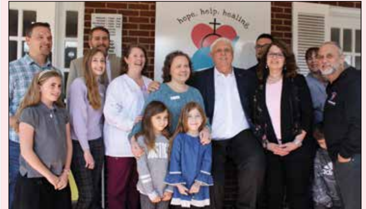
Governor Justice with CrossRoads Pregnancy Care Center Staff and family members