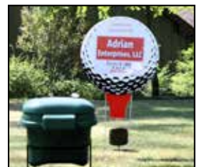
Many thanks to Adrian Enterprises, which sponsored TWO holes.