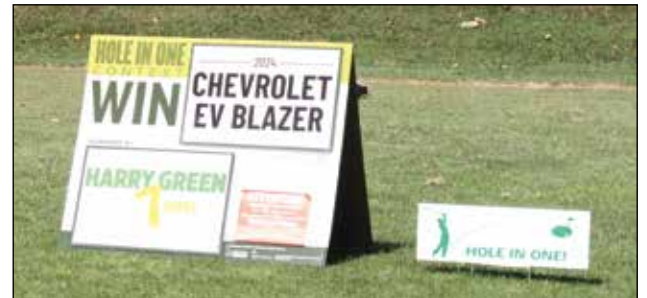
Harry Green Chevrolet again sponsored the Hole-in-One contest on #18, but no one won the gorgeous car.