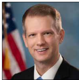
U.S. House of Representatives District 2 Riley Moore

Patrick Morrisey has championed policies designed to safeguard the lives of both unborn children and their mamas from unlimited abortions. He would be a hero to the unborn as West Virginia's next Governor .