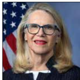
U.S. House of Representatives District 1 Carol Miller