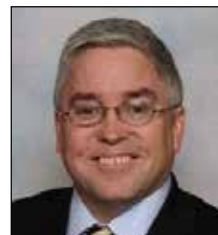
Gov. - Patrick Morrisey