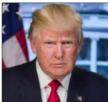
President Donald J. Trump

For voting records and survey answers, see page 4.