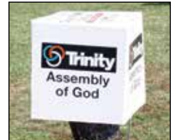
Tee boxes of Gold Sponsor Leech and Platinum Sponsors Trinity Assembly of God and the Wassick Novelty Co.