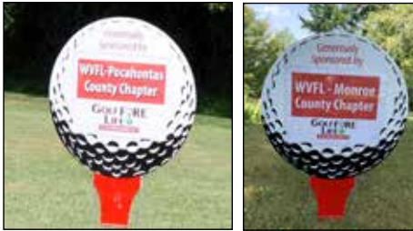
WVFL Chapters Pocahontas & Monroe each sponsored a hole.