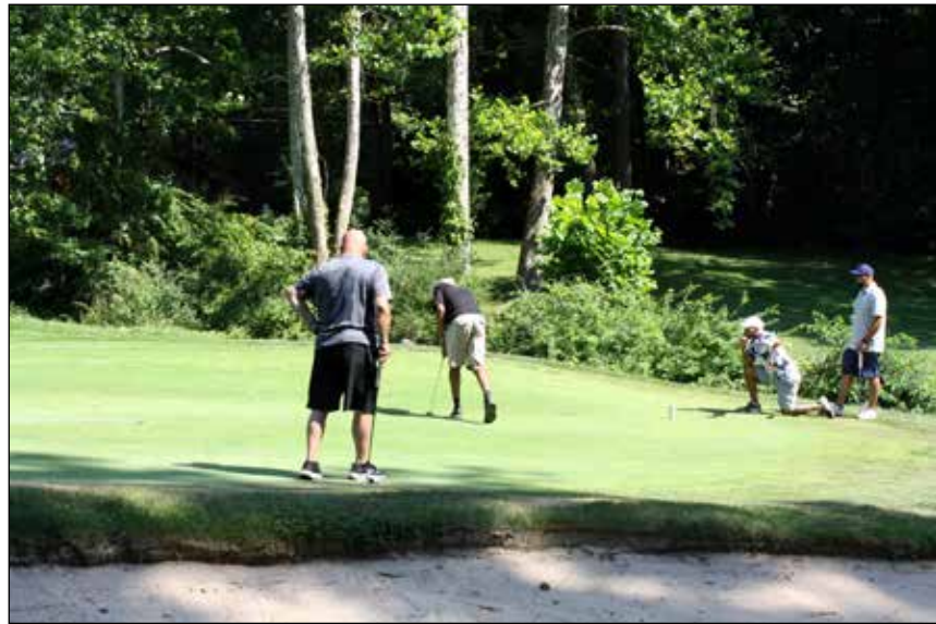
Pound Council Working Hard to Sink that Putt