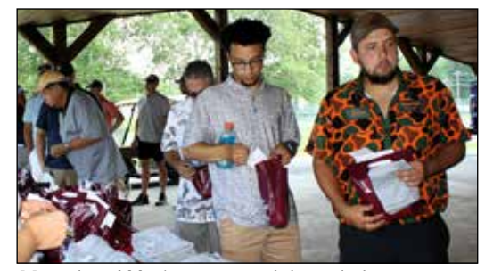
More than 100 players passed through the Registration Line.