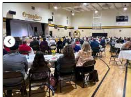
The Northern Panhandle Chapter is actively engaging the community with regular events.