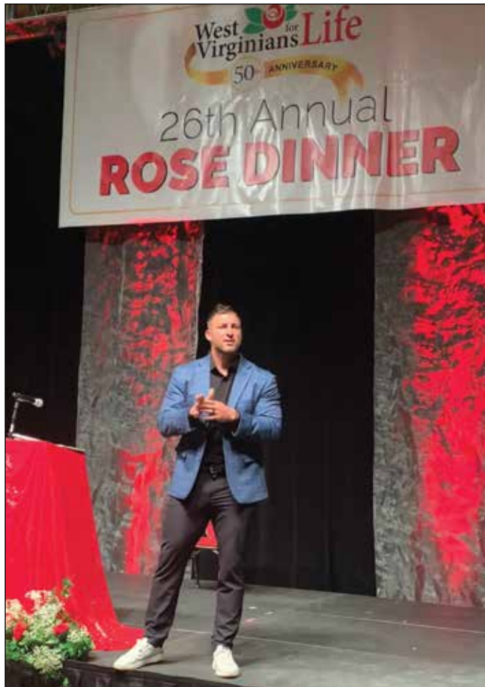
Tim Tebow’s captivating words kept the audience very engaged.