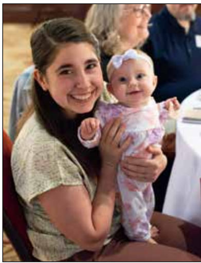
This smiling baby captured the heart of the evening's purpose.