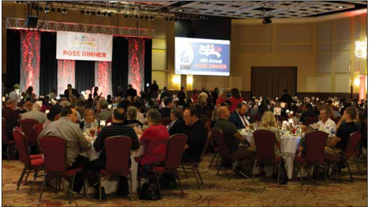
Several hundred people attended WVFL’s 50th Anniversary Rose Dinner