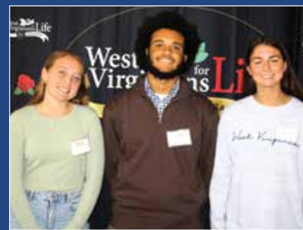
WVU Mountaineers for Life