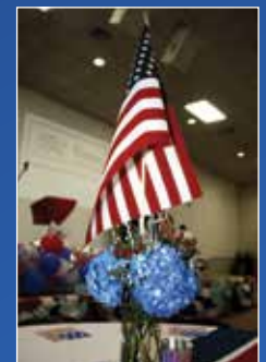
The beautiful decorations, including center-pieces, were courtesy of Linda Day.