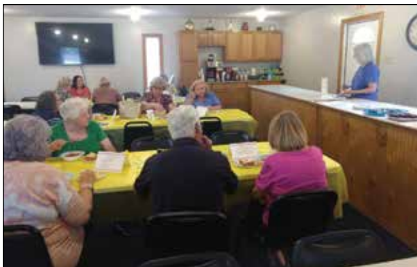
Educational event at Harvest Baptist Church in Moundsville