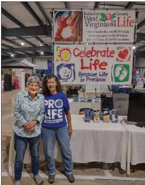
Berkeley County WVFL at Berkeley County Youth Fair