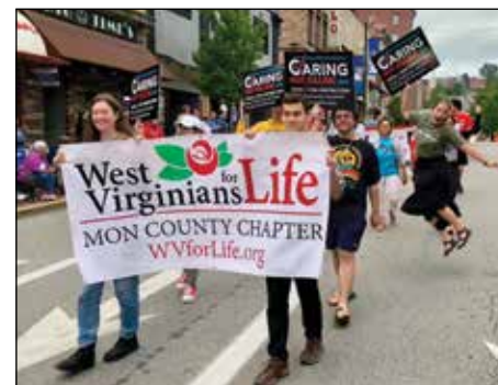
Chapter members participated in the Mon County Fair Parade.